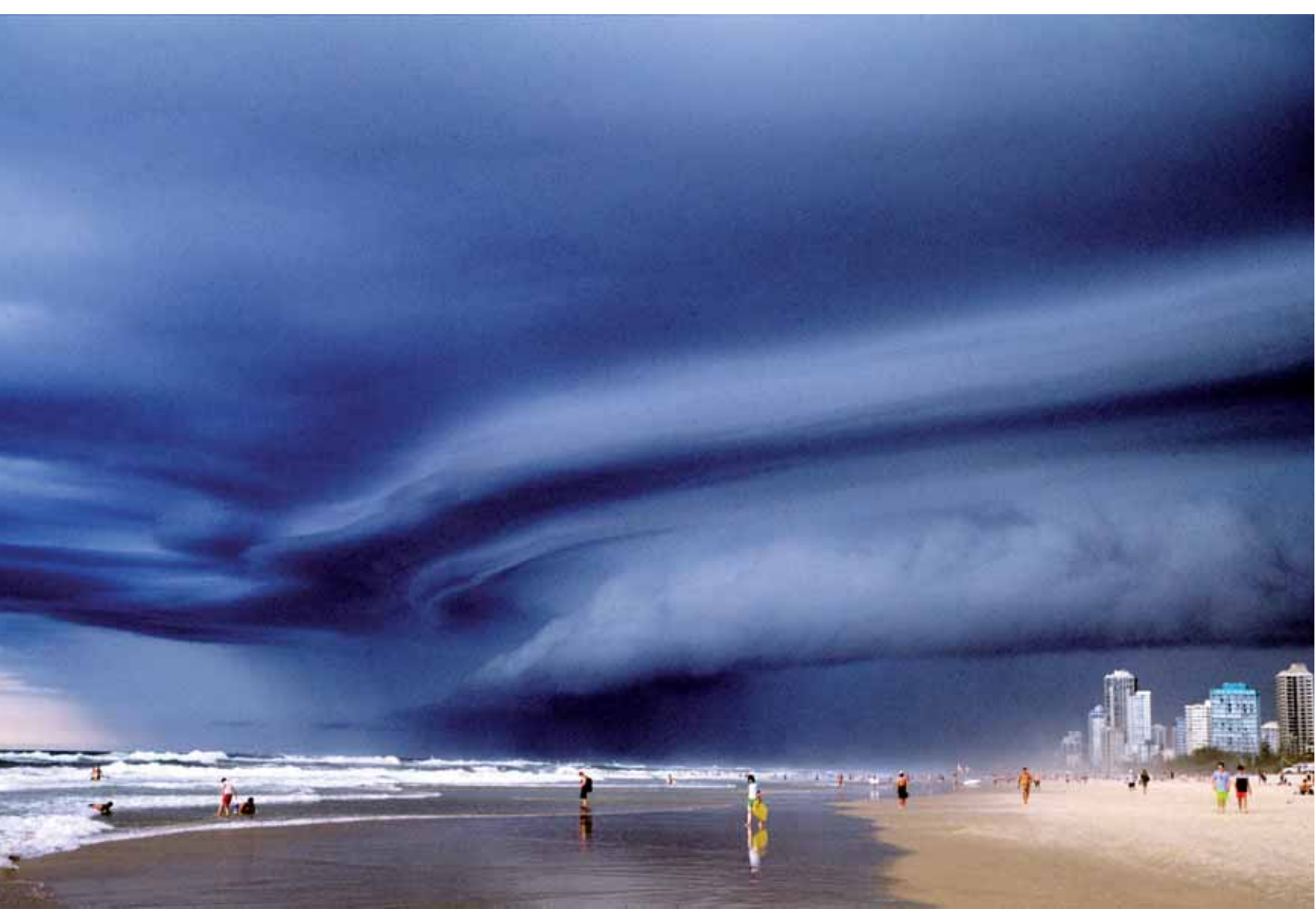
ABOVE A spectacular thunderstorm approaches the Gold Coast, Queensland.